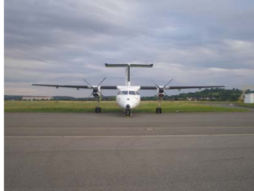
Royal Bengal's 2 nd Aircraft